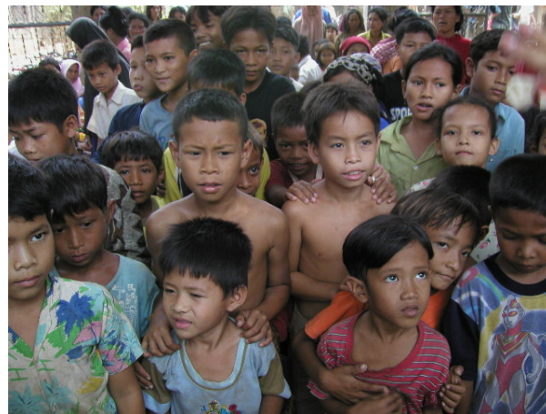
Village children anxiously awaiting for medical check up

This upcoming Laos mission will be the WHA program's largest mission to date. The 22 member team includes physicians, dentists, pharmacists, nurses and support staff and will bring along 1,100 lbs of medicine and medical equipment. The mission will provide care for the typhoon inflicted villages and provide medical teaching and advanced medical instrument to a local hospital in Vientiane, Laos. Daily internet blog and pictures will be posted to the WHA website at www.whausa.org so our members can follow along while the team is deployed in Laos.