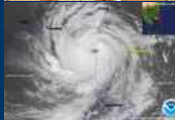
Typhoon Hagupit struck coastal Southeast Asia on September 25, 2008