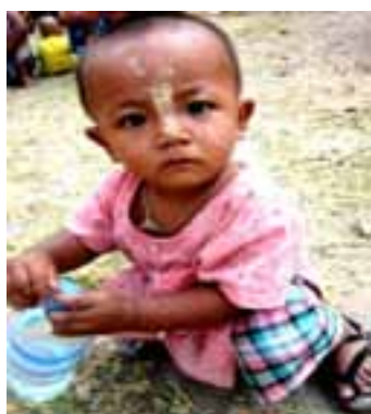
A Myanmar child waiting for care